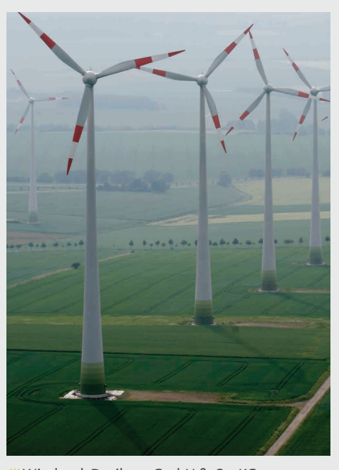
/// Windpark Druiberg GmbH & Co. KG