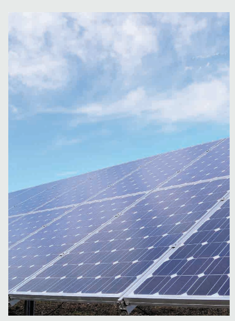
/// High quality products made in SOLAR VALLEY