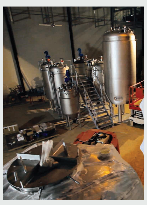
/// Fraunhofer Center for Silicon Photovoltaics CSP